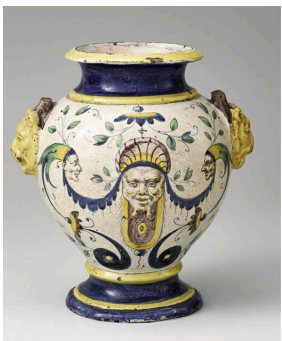
Masséot Abaquesne, Pharmacy pot with grotesques, faience, 16th century, National Ceramic Museum, Sèvres.