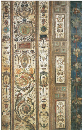
Raphael and his workshop, The Loggia, 1517-19, Palace of the Vatican.