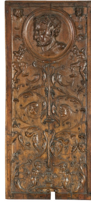
Panel with a medallion, 1st half of the 16th century, France. Museum of Decorative Arts, Paris.