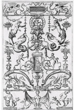
Grotesques motifs by Jacques Androuet du Cerceau, Circa 1550. MET Museum, New York.