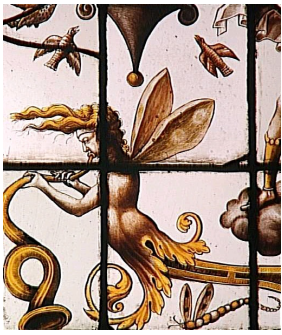
Stained-glass with grotesques decor, 16th century, National Museum of the Renaissance, Chateau of Ecouen