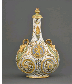
Flask with the emblem of Alfonso II d'Este, Duke of Ferrare, Louvre Museum, Paris.