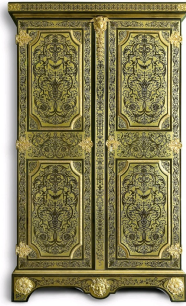
Cabinet, attributed Nicholas Sageot, Paris, circa 1710. Museum of Decorative Arts, Paris.