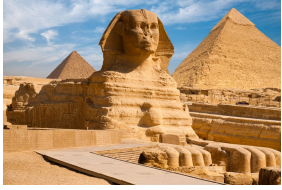
The Great Sphinx of Giza, Egypt, ca. 2558-2532 BC.