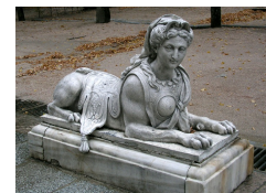
Sphinx, mid-18th century, La Granja, Spain. At the end of the 17th century, the sphinx became a common figure in European gardens.