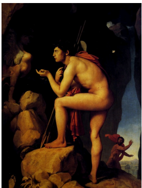
Oedipus and the Sphinx, Ingres, 1808-1827, oil on canvas, Louvre Museum, Paris.