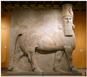
Lamassu, or human-headed winged bull, from Dur-Sharrukin, Neo-Assyrian Period, ca. 721-705 BC, University of Chicago Oriental Institute, Chicago.