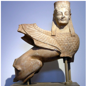
Archaic funerary sphinx, ca. 570 BC, National Museum of Archeology, Athens.