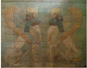
Decorative panel with symmetrical winged male sphinxes from the palace of Darius I at Susa, 522-486 BC, Louvre Museum, Paris.