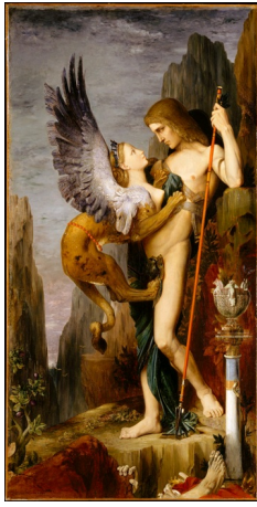
Oedipus and the Sphinx, Gustave Moreau, 1864, oil on canvas, Metropolitan Museum of Art, New York City.

Armchair with Sphinx coming from the Queen bedroom, Chateau of Fontainebleau. 19th century.