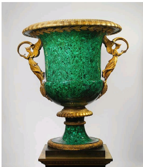
Pierre-Philippe Thomire, Demidoff Vase, 1819, Metropolitan Museum of Arts, New-York.