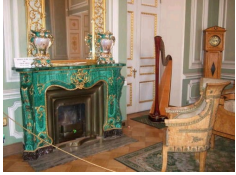
Fireplace of the Youssouпов Palace, circa 1860, Saint-Petersburg.