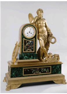
Pierre-Philippe Thomire, Apollo Clock, Museum of the Malmaison and Bois-Préau Castles.