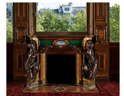
Malachite plated fireplace of the Paiva Hotel, 1856-1866, Paris.