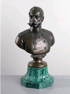
Ivan Kovshenkov, Portrait bust of Alexander II, Tsar of Russia, 1873, Hermitage Museum, Saint-Petersburg.