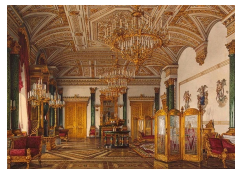
Konstantin Andreyevich Ukhtomsky, The Malachite Room of the Winter Palace, 1865, watercolour, Hermitage Museum, Saint-Petersburg.