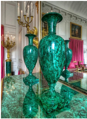
Ornamental vases of the Malachite Room of Trianon, 1808, Versailles Palace.