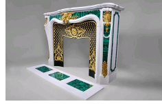
« Paiva » Fireplace in white Carrara marble and malachite, Maison&Maison.