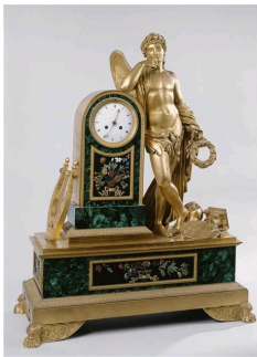
Pierre-Philippe Thomire, Apollo Clock, Museum of the Malmaison and Bois-Préau Castles.