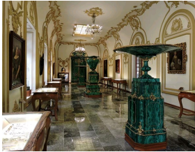
Malachite Room of Chapultepec Castle, 1775, Mexico.

1917-1835-Nijni TaguilCount Demidoff 1775Chapultepec Castle""191808""Salon des Malachites ·Pierre-Philippe Thomire 1835-""Alexandre Briullov1839-