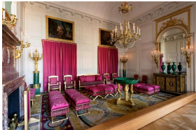
Malachite Room of Trianon, 1808-1809, Versailles Palace.