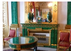
Fireplace, table and pilaster in malachite in the Winter Palace, circa 1840, St-Petersburg.