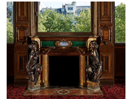
Malachite plated fireplace of the Paiva Hotel, 1856-1866, Paris.