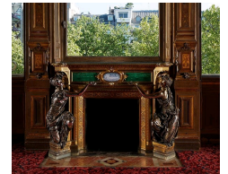
Malachite plated fireplace of the Paiva Hotel, 1856-1866, Paris.