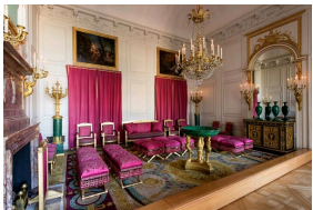
Malachite Room of Trianon, 1808-1809, Versailles Palace.