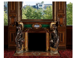
Malachite plated fireplace of the Paiva Hotel, 1856-1866, Paris.