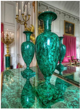
Ornamental vases of the Malachite Room of Trianon, 1808, Versailles Palace.