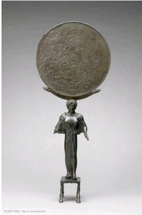
Caryatid mirror made of bronze, 490-480 BC, Provenance: Thebes(?), Aegina style.