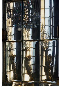
Hall of Mirrors mirrors (beveled mirrors detail), Versailles Palace.