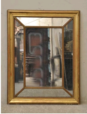
Mercury mirror with a gilded stucco and wood framing.