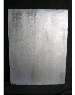
Mercury mirror's back.