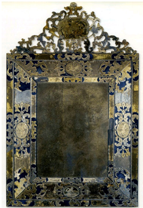
Venetian mirror maker, Mercury mirror with a glass framing, late 17th - early 18th century.