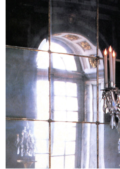
Hall of Mirrors (tinning detail), Versailles Palace.