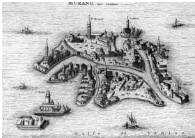
Danckerts, the city of Venice (detail of the island of Murano), circa 1600, engraving.